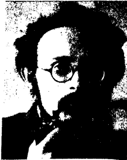
Yakov Sverdlov, Economic Czar under Lenin.