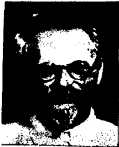
Leon Trotsky, first head of the Red Army.