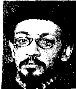
Karl Radek, head of the OGPU (KGB), murdered millions of Christians.