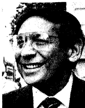
Rep. Ted Weiss

Obituaries are short but often reveal the whole story of a person's life.