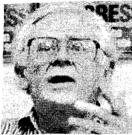
Joe Slovo, Jewish head of South African Communist Party, controls (ANC).

The truth is that it was Jewish Marxists who seized control of Russia. Karl Marx was descended from a