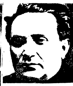
Grigori Zinoviev (Applebaum)