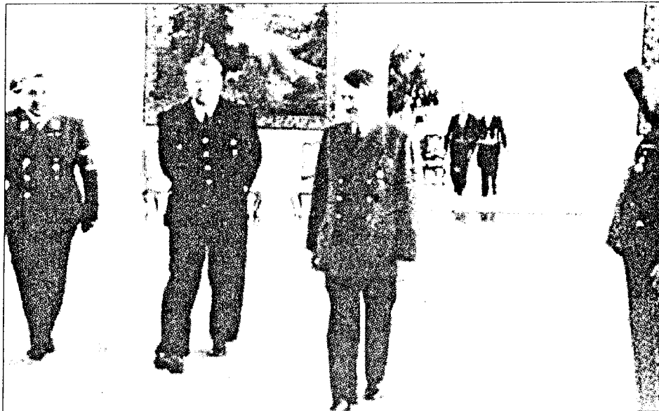
Adolf Hitler meets Vidkun Quisling in the fall of 1939. Quisling had been in Germany many times, pushing for a German-Norwegian agreement for German leader to a Norway independent, would be a German-Norwegian agreement with Germany Reichskommissar, Norway, and the German-Norwegian agreement.

During the immediate pre-war years (1938-1939), convinced of the stupidity of a new European war, Quisling dedicated much effort and time attempting to stop it. At the national level he fought for a rigorous neutrality and the rearmament of his poorly defended county; this in order to protect its declared neutrality. But his demands were not heeded, and Norway slipped closer to catastrophe. Internationally, he requested the involved parties to stop it before it started. He contacted other Nordic national-